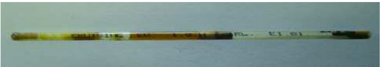
A straw of Equine Semen

some £190,000 (including £146,800 for the semen destroyed). NIAO has reviewed the methodology underlying the £190,000 valuation and agrees with the Department's view that this was flawed as a number of erroneous assumptions were made regarding the quality and quantity of semen. Currently, the Department still has semen in its possession belonging to three stallions.