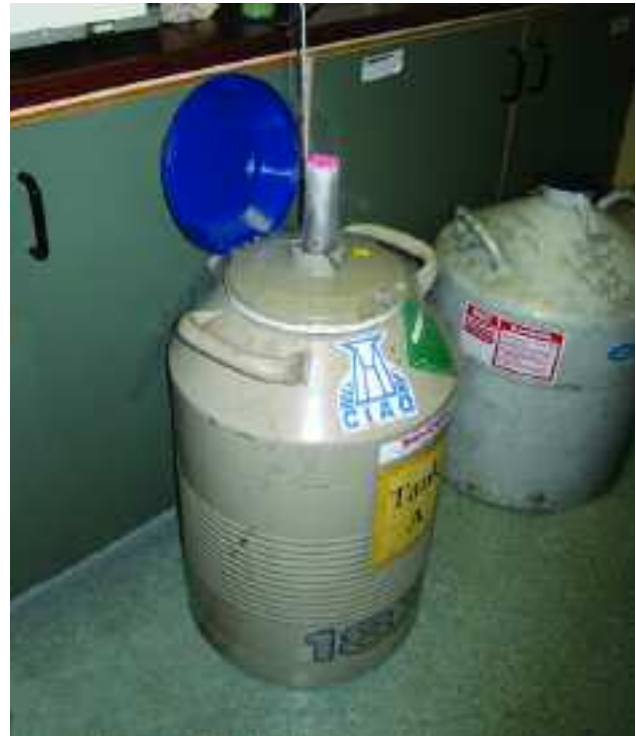
Liquid Nitrogen tank containing remaining frozen semen straws

3.17 Valuations for equine semen stock have ranged from £45,000 (pre-liquidation of Sport Horse) to 'Nil' see Figure 3.1 . The basis for the 'Nil' valuation of the semen stock, because of uncertainties over authenticity and health status, is pertinent to the Freedom of Information request addressed in paragraphs 3.20 to 3.25 below. NIAO reviewed papers prepared by the College which put an estimated value for the semen held in the two tanks in 2006 at