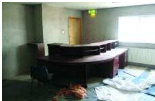
Unfinished reception area.

years. However, the Department found that it could not lease the Centre as it had been built without planning permission and building control certificates and was constructed to agricultural - not commercial - standards, even though the Centre would have been used for commercial purposes by Sport Horse.